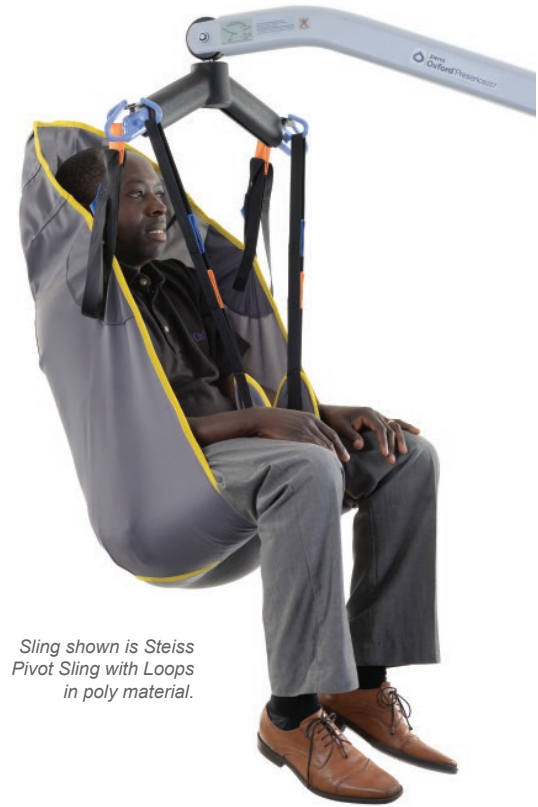
Sling shown is Steiss Pivot Sling with Loops in poly material.